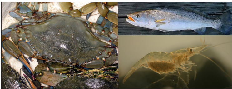
Blue crabs and speckled trout spend a portion of their lives in salt marshes and grass shrimp live there permanently.

The coasts of Alabama and Mississippi were not as severely impacted as those of Louisiana following the Deepwater Horizon disaster, receiving only light and patchy oiling; however, many of the organisms that live in the marsh spend a portion of their early lives offshore amongst the plankton, putting them in harm's way of oil in the open Gulf. Scientists at the Dauphin Island Sea Lab are currently monitoring populations of animals that take refuge in the salt marshes and seagrass meadows of coastal Alabama to determine whether they have been significantly impacted by the disaster. In particular, researchers are closely monitoring species that spend their early