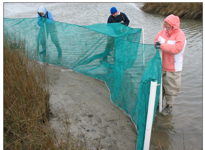
Researchers use a specially designed net to trap animals that use the marsh during high tide.

The potentially harmful effects of dispersed oil on plankton, including larval saltmarsh and seagrass species, in coastal habitats are unknown but likely widespread. Long-term monitoring of coastal marsh-seagrass systems is required to determine if the Deepwater Horizon accident has resulted in decreased finfish and shellfish populations in coastal nursery habitats. Coastal nurseries, therefore, have the potential to serve as indicators of change for the Gulf of Mexico. Over the coming months and years, scientists will continue using random sampling methods (i.e., trawling, coring and quadrat sampling) to gather abundance and biodiversity data from study areas to better understand if coastal habitats have been impacted.