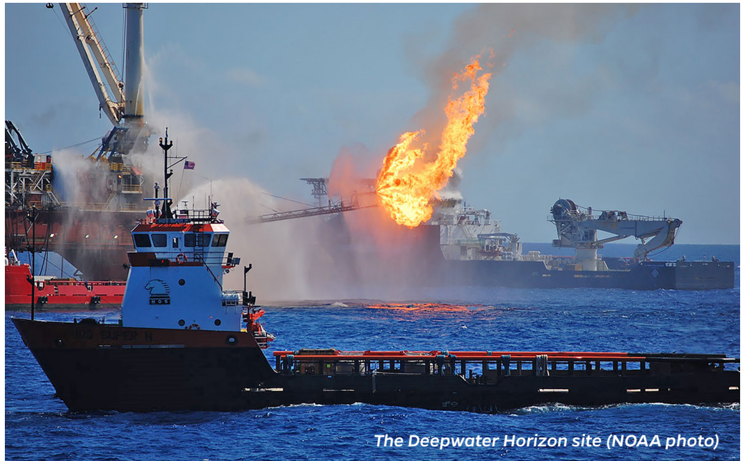
The Deepwater Horizon site

Nearly two million gallons of dispersants were used at the water's surface and a mile below the surface to combat oil during the Deepwater Horizon oil spill. Many Gulf Coast residents have questions about why dispersants were used, how they were used, and what impacts dispersants could have on people and the environment.