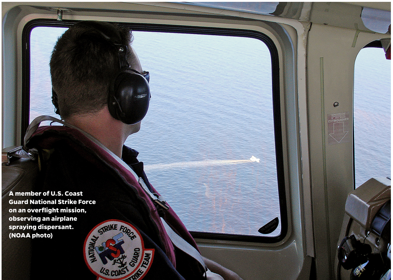
A member of U.S. Coast Guard National Strike Force on an overflight mission, observing an airplane spraying dispersant.

The extent of damage that dispersants, dispersed oil, and oil can have on aquatic life is still under debate. Some peer-reviewed research studies have found dispersants to be less toxic than oil alone, and other studies have shown that dispersants or oil plus dispersant are more toxic than oil alone. 7