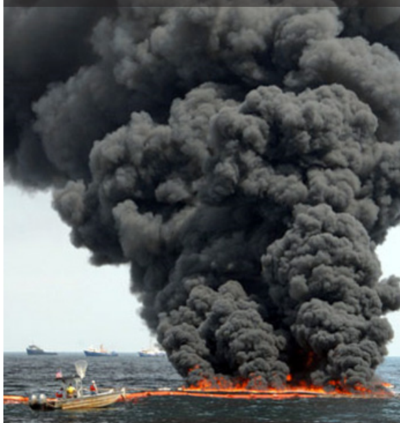
Controlled burning (left) and skimming (right) are two response techniques used to remove oil from the water surface after an oil spill.