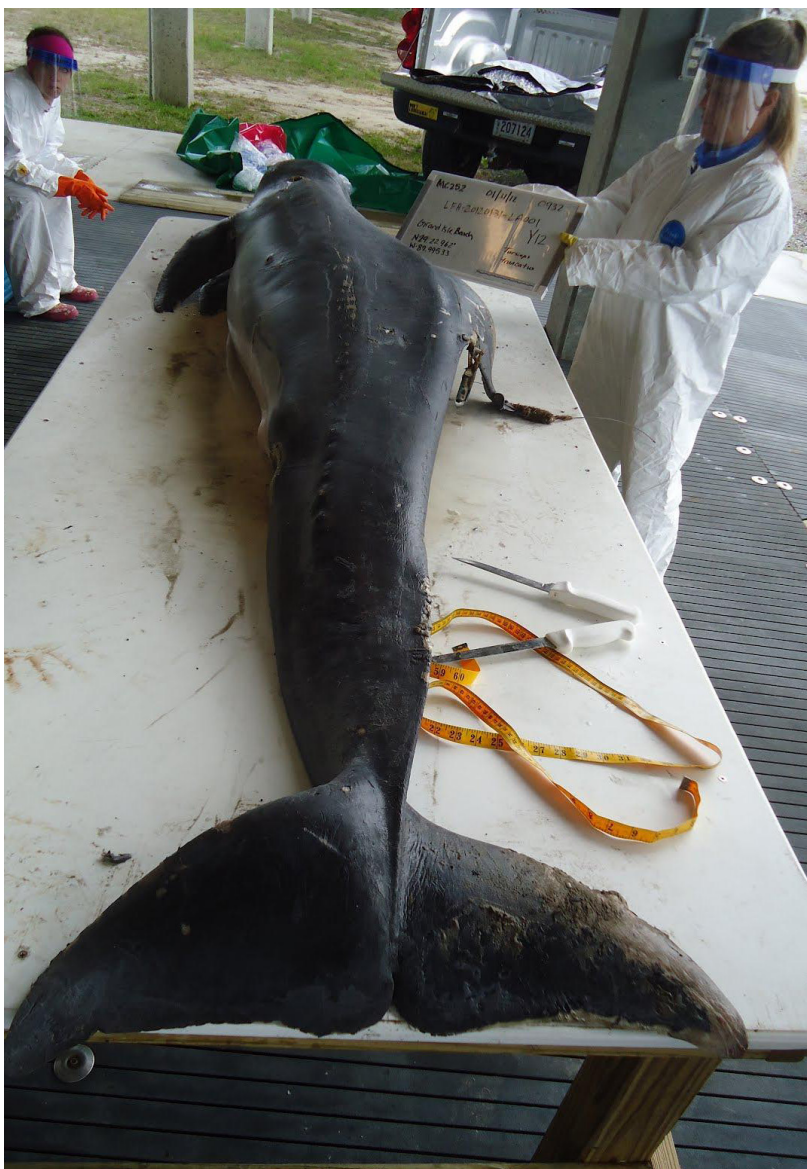
Scientists retrieved this dead dolphin from Grand Isle Beach, Louisiana, in January 2012. The visible ribs and depressions along the back are signs of extreme weight loss.

An increase in dolphin strandings occurred primarily along the coasts of Lake Pontchartrain in Louisiana and western Mississippi in March through May 2010. So what was the cause of the deaths during this time? Scientists believe that prolonged exposure to low salinity and cold temperature in these areas resulted in dolphin deaths. 11,17 They also believe that the changes to temperature and salinity may have affected the dolphins' habitat and food sources. 10