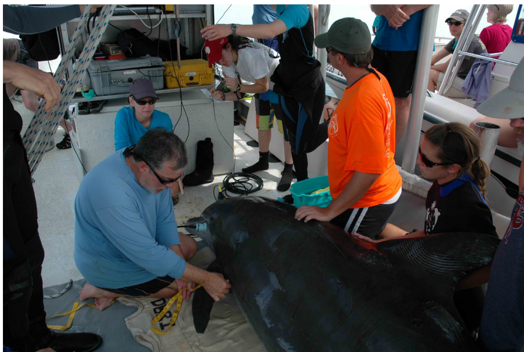
Scientists measure a healthy 21-year-old adult male during a dolphin health assessment in Sarasota Bay, Florida. Scientists studied dolphins in this area to provide a comparison because Sarasota Bay did not receive Deepwater Horizon oil.

The unusual mortality event is closed, but it does not mean that the effects of oil on these marine mammal populations have ended. Scientists continue to study dolphin populations throughout the Gulf of Mexico and monitor the long-term health effects of the oil spill.